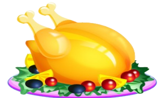
LOOKING MIGHTY GOOD