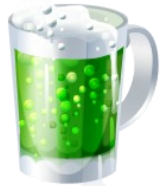
Green Beer for all Horseshoe Pitchers!